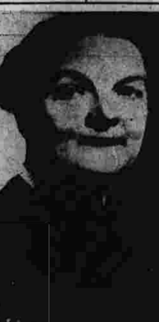
Mrs. Agnes E. Meyer